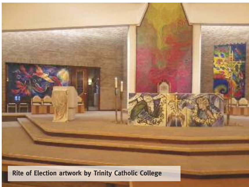
Rite of Election artwork by Trinity Catholic College