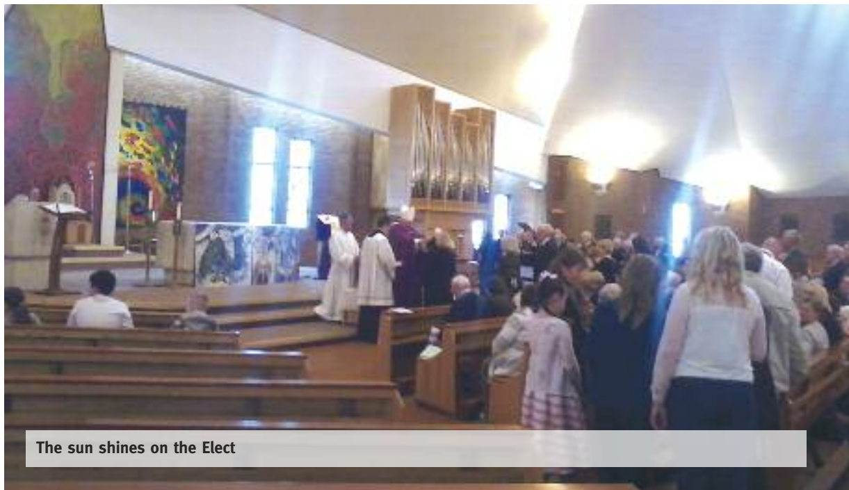
The sun shines on the Elect