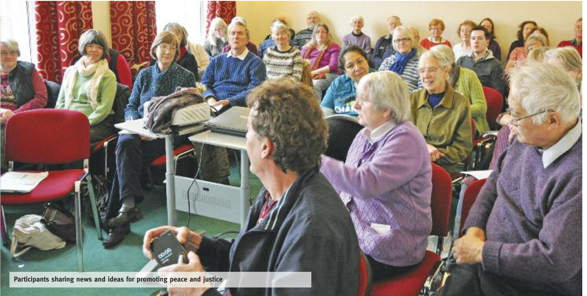
Participants sharing news and ideas for promoting peace and justice