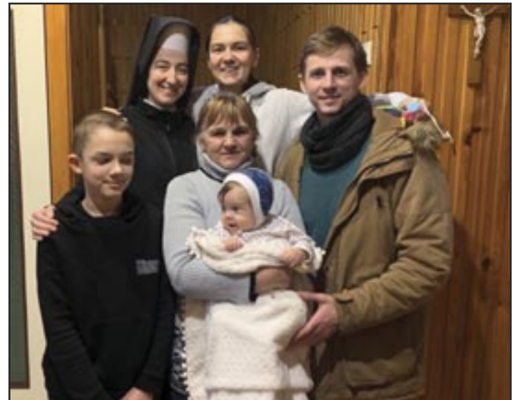
A sister with a refugee family being cared for in Lviv, Ukraine