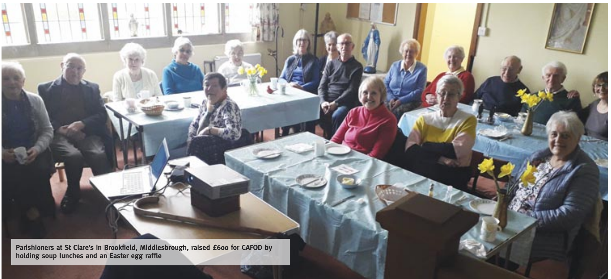
Parishioners at St Clare's in Brookfield, Middlesbrough, raised £600 for CAFOD by holding soup lunches and an Easter egg raffle