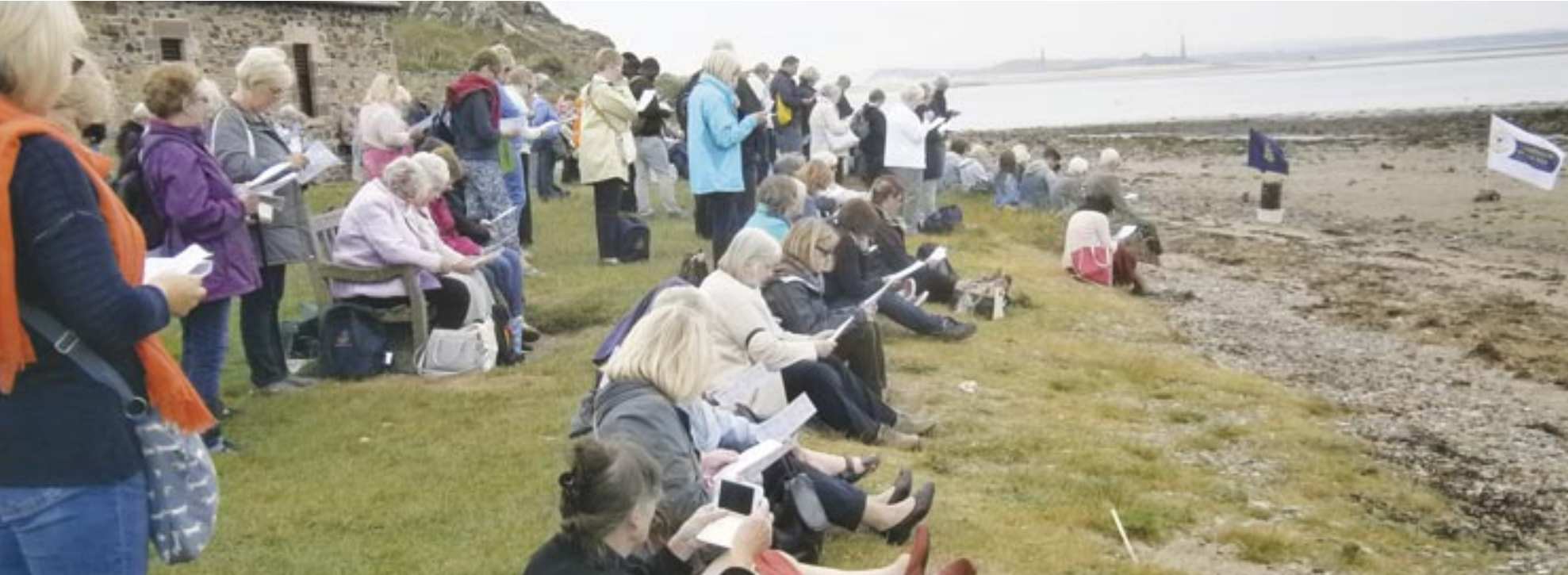
A previous Stella Maris pilgrimage to Holy Island