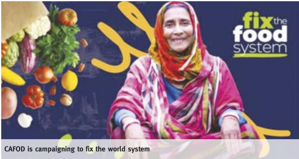
CAFOD is campaigning to fix the world system

Forests and rainforests are cut down or burned to make huge areas available for