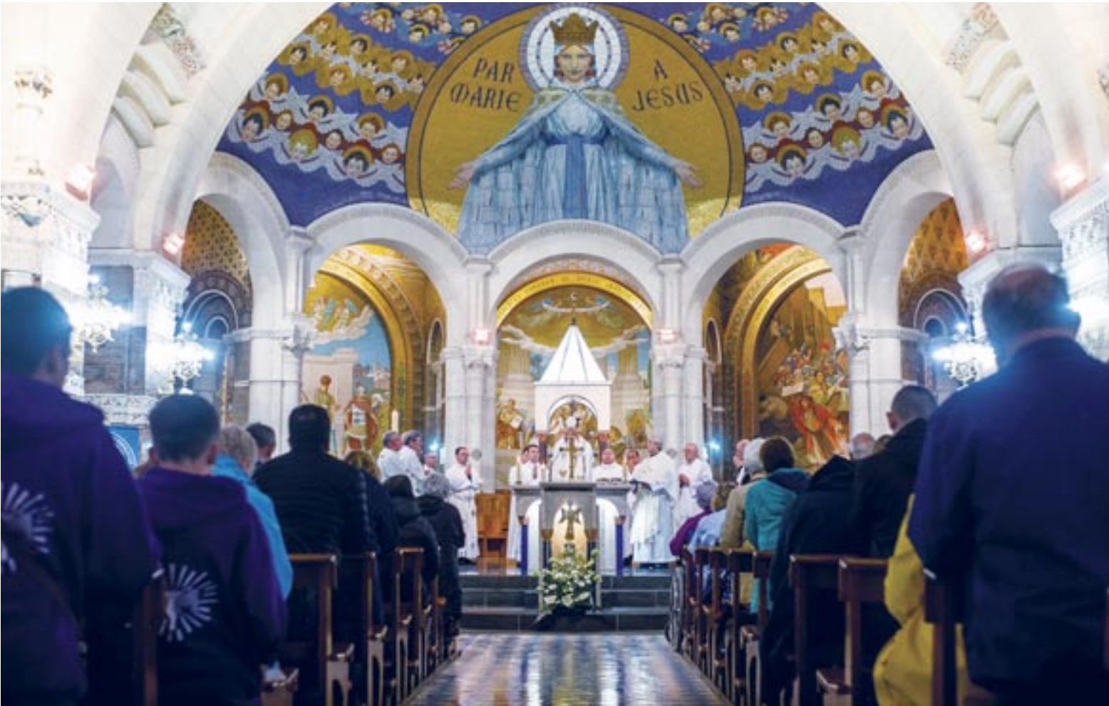
Bishop Terry celebrating Mass in the Rosary Basilica