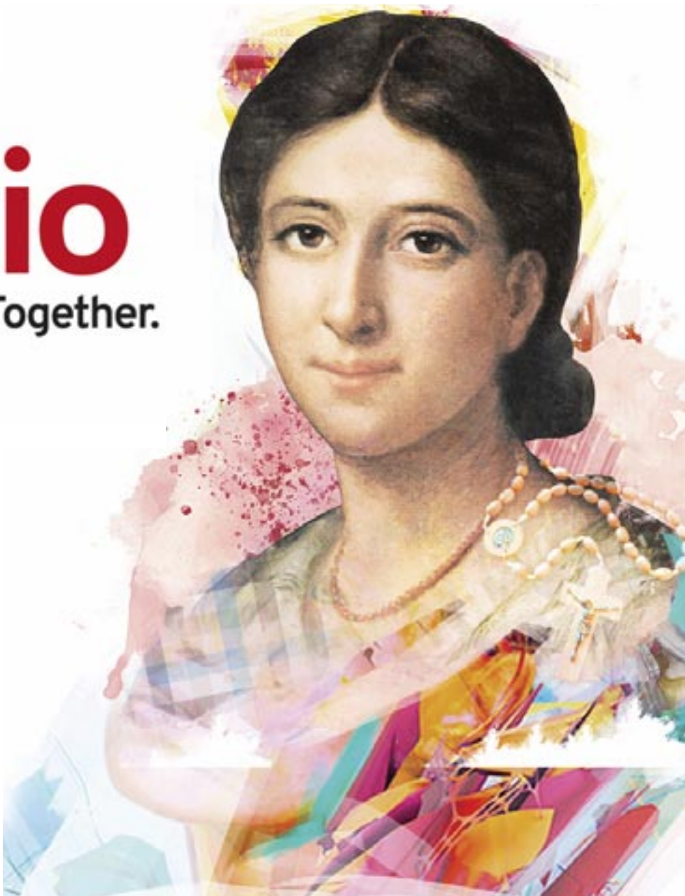
Pauline Jaricot, who is one of Missio’s founders

As the Pope’s official charity for world mission, Missio enables Catholics to live out the call received at baptism, to share God’s