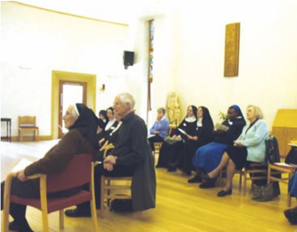
Religious gather at Thicket Carmelite Monastery in York