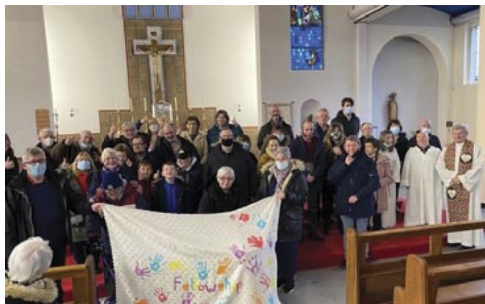
Middlesbrough Catholic Fellowship invites you to join them at their monthly Mass

March saw us visit the Sacred Heart in Redcar. It has certainly been a long time since we visited this parish, as we had regularly visited St Augustine's.