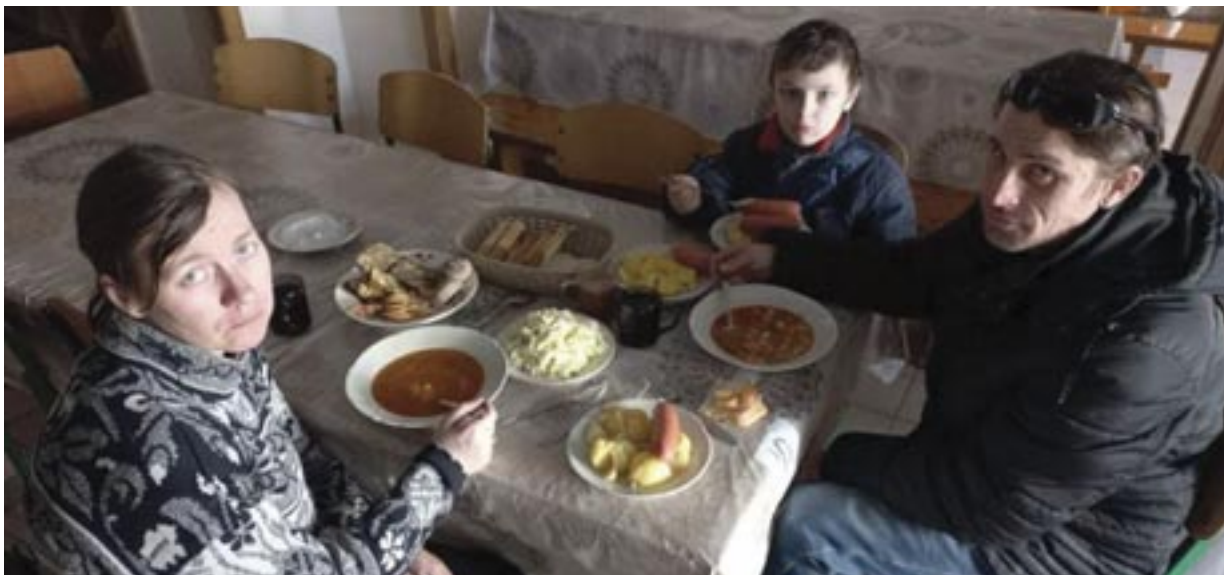
A family being cared for at the Exaltation of the Holy Cross Monastery, Buchach

The Basilian's provincial house in Briukhovychi, near Lviv, is caring for 150 women and children, who are allowed to stay in the monastery for as long as they need to.